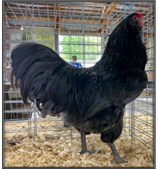
Russ Blair's Blue Large Fowl Cock