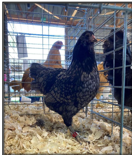
Russ Blair's Blue Bantam Hen